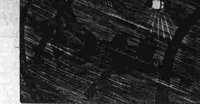
The Tononville Trolley That Meets All the Trains By Fontaine Fox